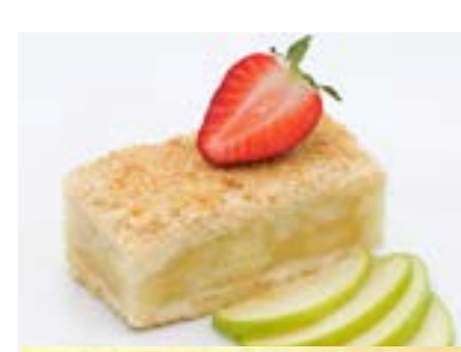
APPLE CRUMBLE TRAYBAKE €29.95 44PTN FPAG48191