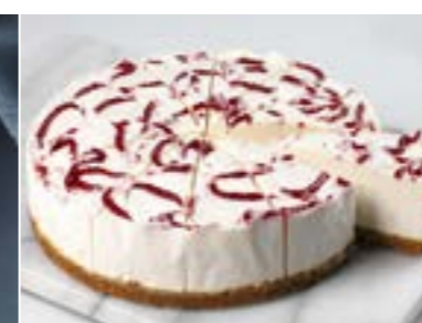
WHITE CHOC & RASPBERRY €16.95 12PTN FPAT4829