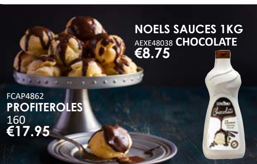
FCAP4862 PROFITEROLES 160 €17.95