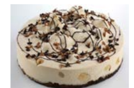
HAZELNUT & PROFITEROLE GATEAU €19.95 12PTN FPAT4890