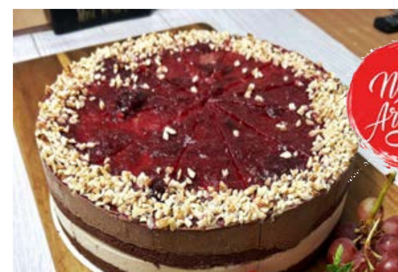
FPAT4821 Chocolate Cherry Hazelnut Mousse Cake 12PTN €18.50