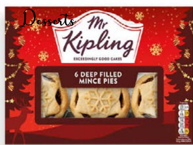
ALYN4798 Mince Pies 6 x 20 €49.00