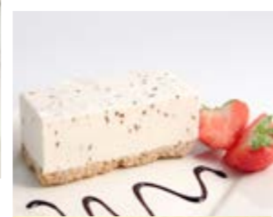
BAILEYS CHEESECAKE TRAYBAKE €36.00 44PTN FPAG48219