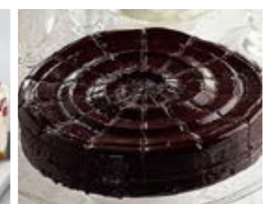
CHOCOLATE FUDGE €17.95 14PTN FPAG48213