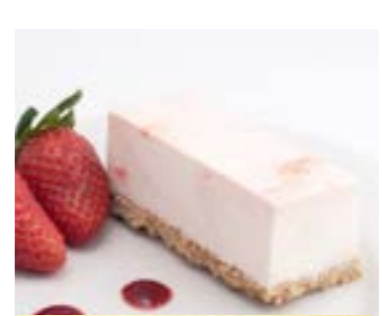
STRAWBERRY CHEESECAKE €36.00 44PTN FPAG48190