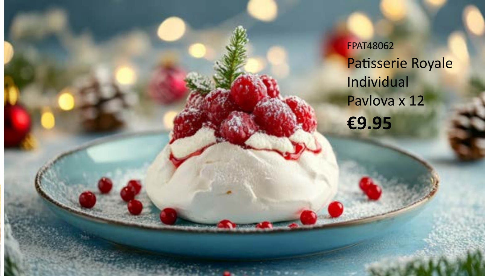
FPAT48062 Patisserie Royale Individual Pavlova x 12 €9.95