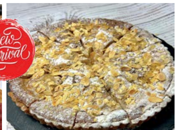
FPAT4822 Christmas Spiced Fruit & Almond Tart 12PTN €17.50