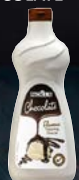
NOELS SAUCES 1KG CHOCOLATE €8.75