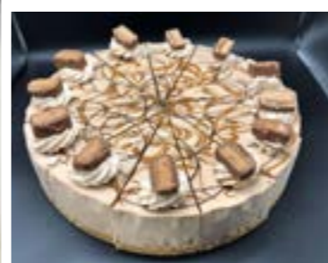
MARS CHEESECAKE €16.95 12PTN FPAT4888